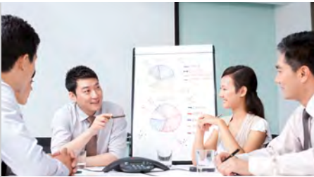
Supply Chain Planning

By understanding and anticipating your business and logistics needs in an ever-changing environment, our dedicated teams of supply chain consultants provide a reliable source of expertise. We provide you with advisory and/or consulting services, for example, an in-depth analysis of all network flows and supply chain processes across your organization in order to re-engineer and develop an optimized supply chain.