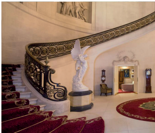
The breathtaking Luton Hoo Mansion House with its formal gardens designed by Capability Brown in the mid 1700s.