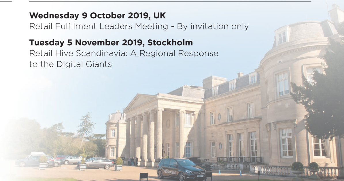
Luton Hoo Hotel & Golf Spa

Retail Hive Scandinavia: A Regional Response to the Digital Giants